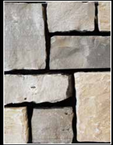
Dark River Ledge