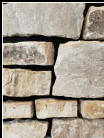
Sleeping Bear Ledge