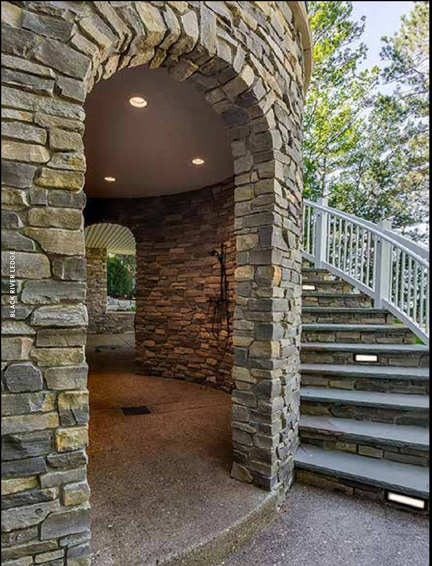
BLACK RIVER LEDGE