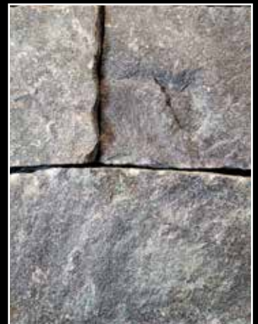
Moon Shadow Sq/Rec