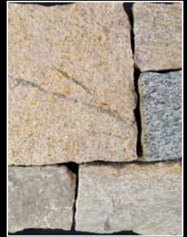
Northwind Sq Strips