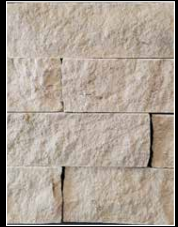
Hickory Hills Ledge 35