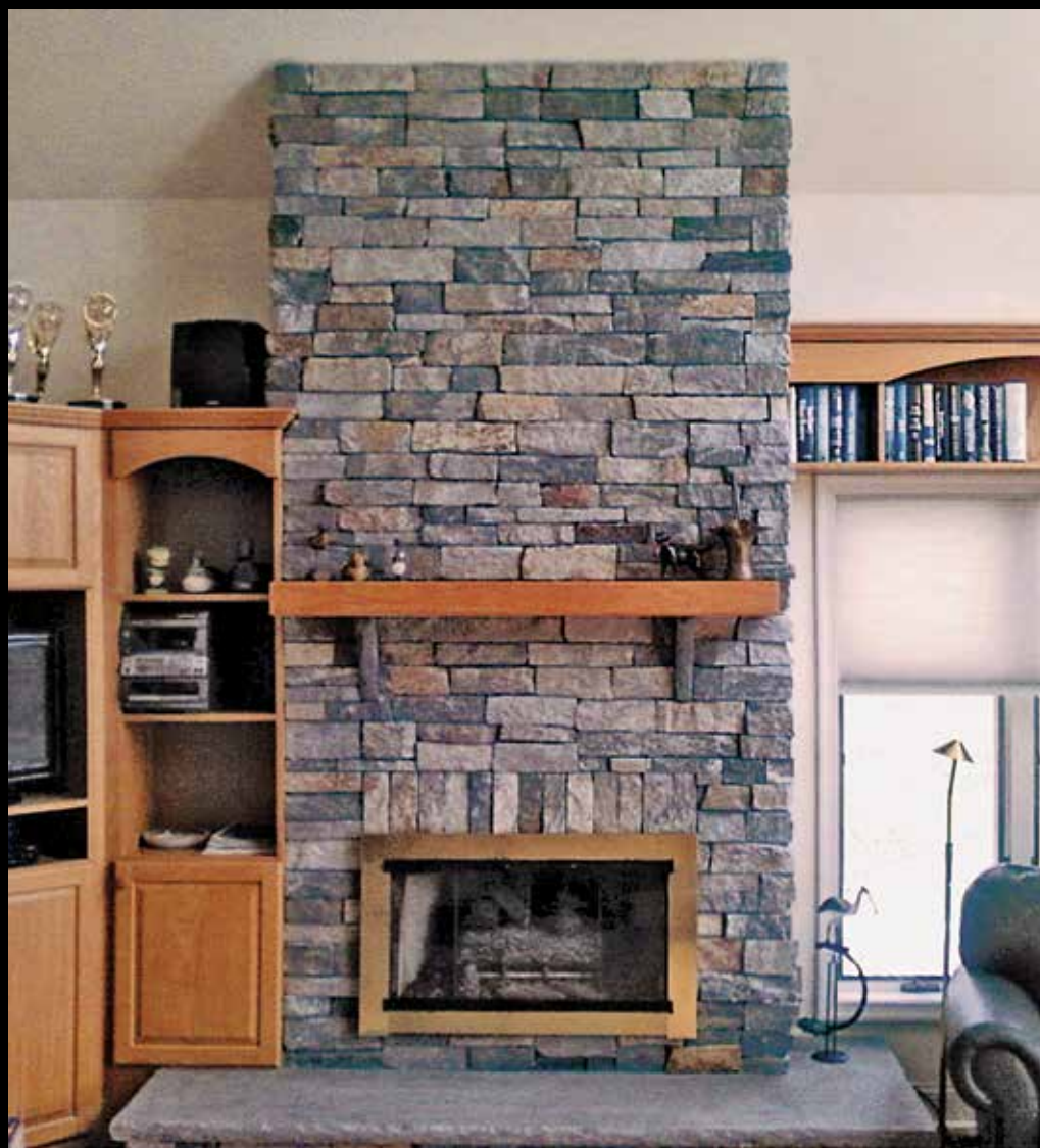
OLD RIVERBED LEDGE

The Oak Park Collection from Designer's Choice Stone isn't limited to just exteriors and facades. More and more, stone is finding its way inside homes. Stone brings warmth and character to stainless-steel kitchens. It introduces subtle color to bedrooms, dining rooms and bathrooms. With its dazzling array of tones and textures, our Oak Park Collection is an incredibly expressive building material.