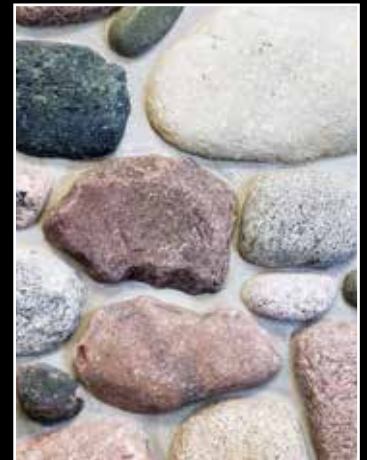
Michigan Cobble Fieldstone