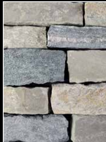
Rocky Shore Ledge