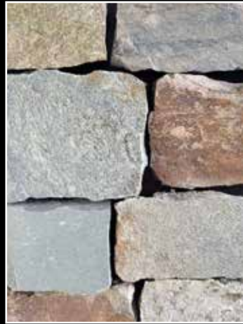
Legend Sq Strips