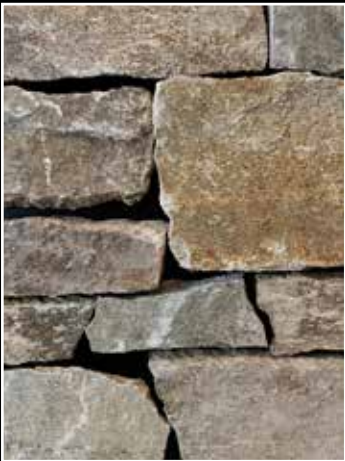
Empire Bluff Blend