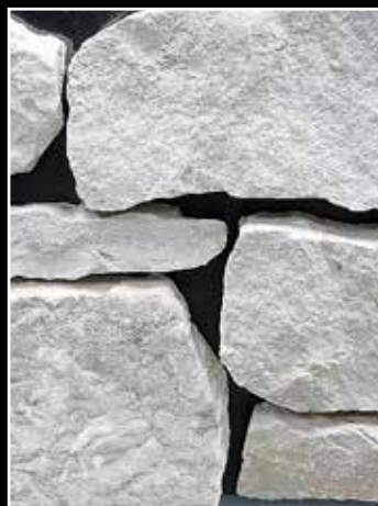
Old Mission Ashlar