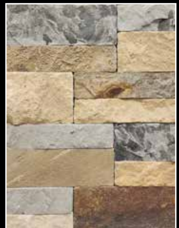
Woodland Path 2, 3, 4