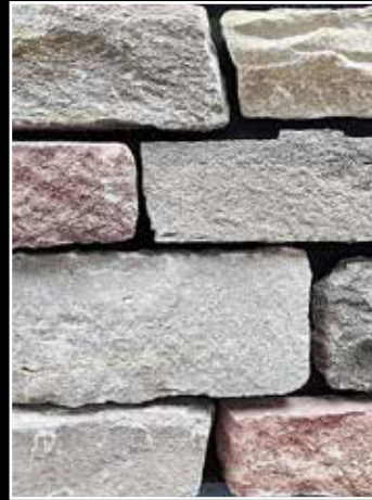
Grand Sable Ashlar