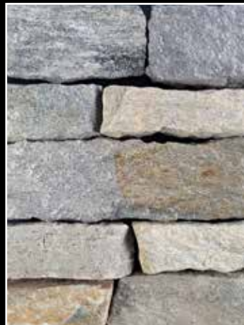
Old Riverbed Ledge