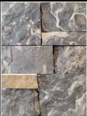
Shoreline Ledge 246