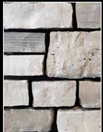
West Bay Blend