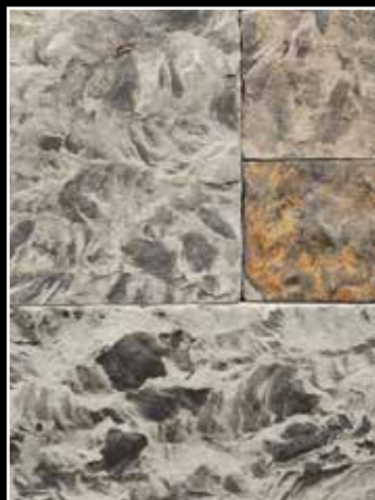
Vista 5, 7-3/4, 10-12