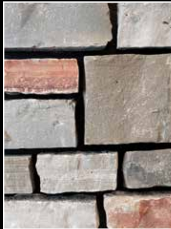
Good Harbor Blend