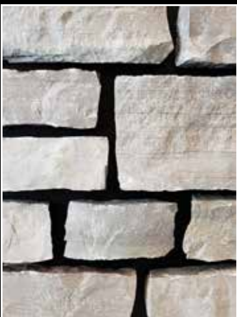
North Bar Blend