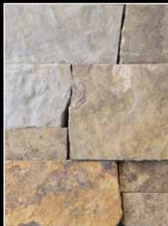
Whitetail Ledge 246