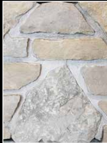
Lake Ann Blend