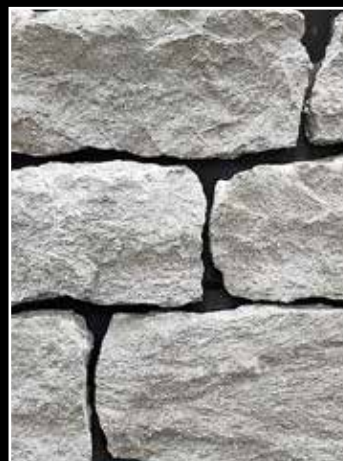
Thunder Bay Ashlar