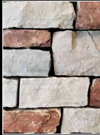
Bowers Harbor Blend