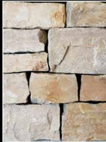
Empire Dunes Blend