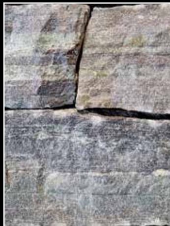
Moon Shadow Ashlar