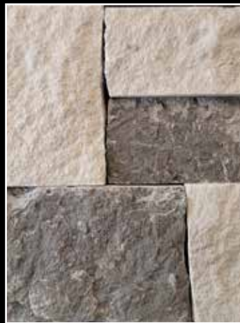
Overcast Stack 486 Tile