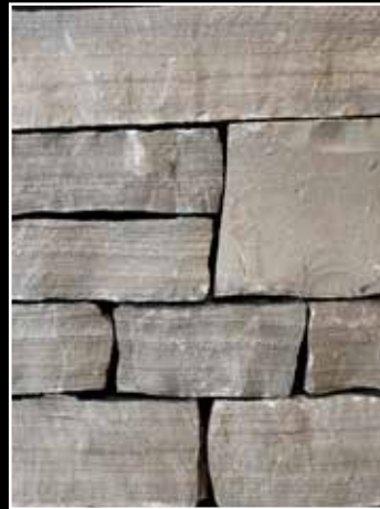
Glen Arbor Grey