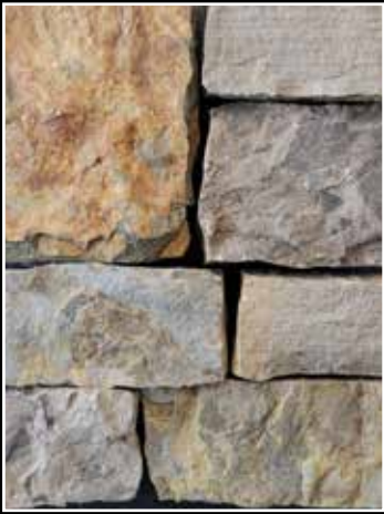
Dark Twilight Ashlar