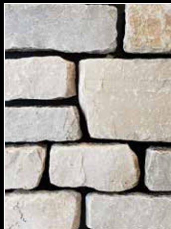
Torch Bay Rustic