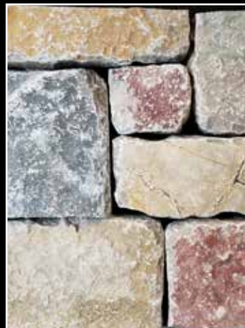
Old Town Tumbled