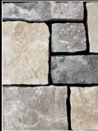
Duck Lake Castle