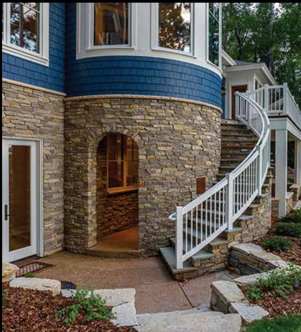
BLACK RIVER LEDGE

The Michigan Collection from Designer's Choice Stone is created from the very foundations of this Great Lakes State. This collection contains some of our most popular color blends and textures. From the subtle greys and earth tones found in Black River Ledge and Great Lakes Ashlar to the majestic, vibrant colors of Michigan Cobble and Split Fieldstone, these stones say "Welcome to Northern Michigan."