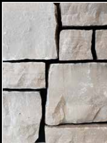
Suttons Bay Cobble