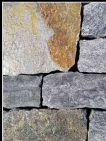
Sparkle Sq Strips