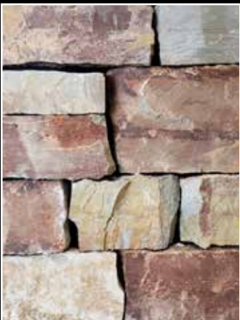
Late Harvest Blend