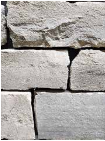
Black River Ashlar