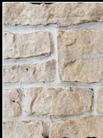
Union St Blend