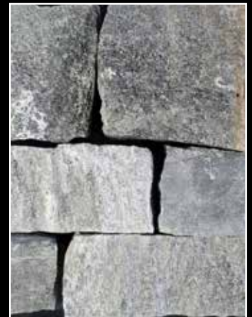
Shadow Sq Strips