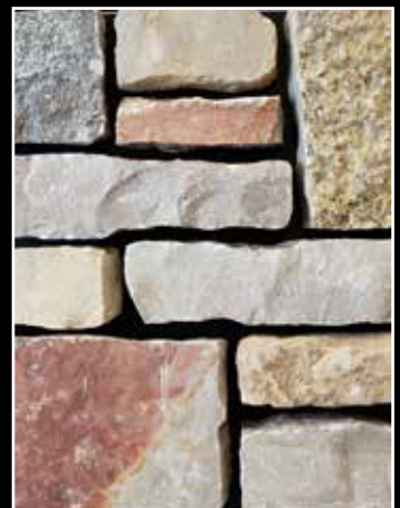
Torch Lake Blend