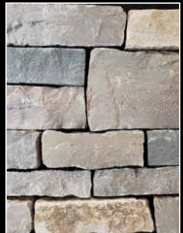
Platte Rive Blend