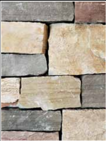
Crystal Lake Blend