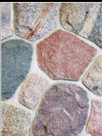
Michigan Split Fieldstone