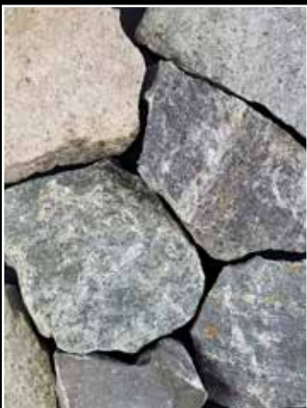
South Bay Granite Irreg.