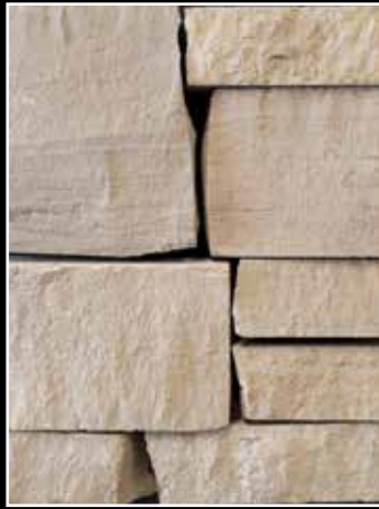
Eighth St. Dimensional