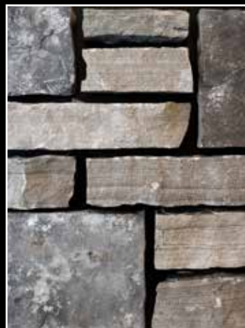
Stoney Point Blend