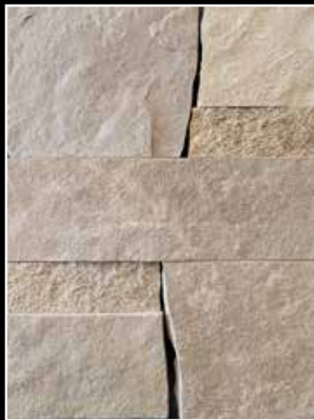
Lakeridge Ledge 246