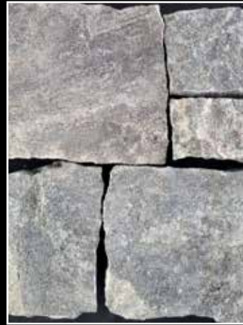
Lonepine Sq Strips