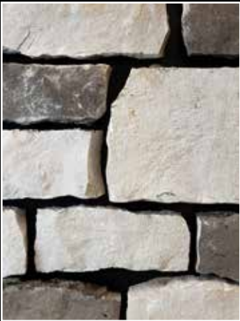
Deep Water Point Blend