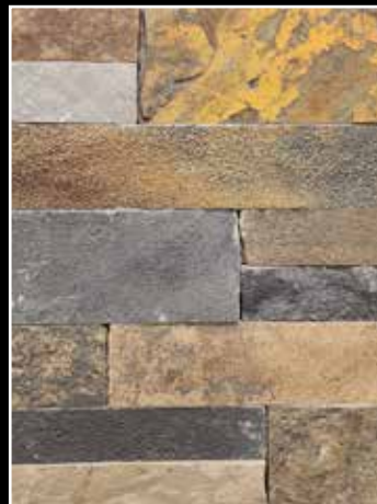
Kids Creek Blend