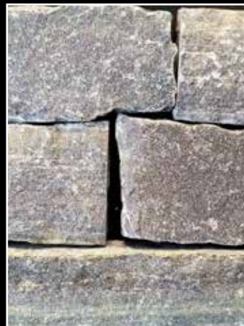
Moon Shadow Ledge