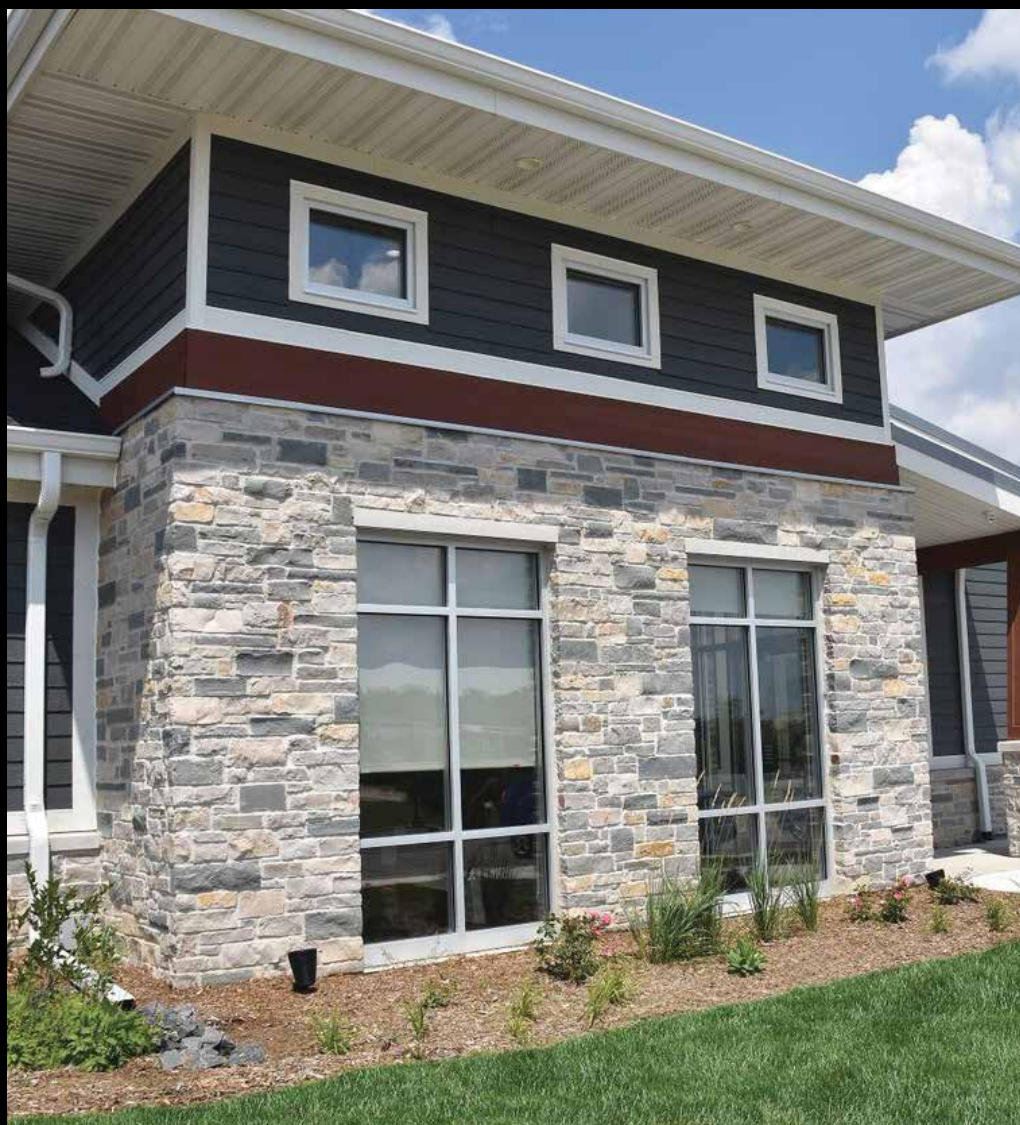
PLATTE RIVER BLEND

The Slab Town Collection from Designer's Choice Stone is a style of stones that are very rugged and irregular. These stones are irregularly shaped pieces of bedface stone. The random shapes and sizes of these rough-edge stones create exciting patterns for both contemporary and rustic classics