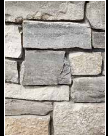
Great Lakes Ashlar