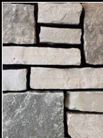
South Bar Blend