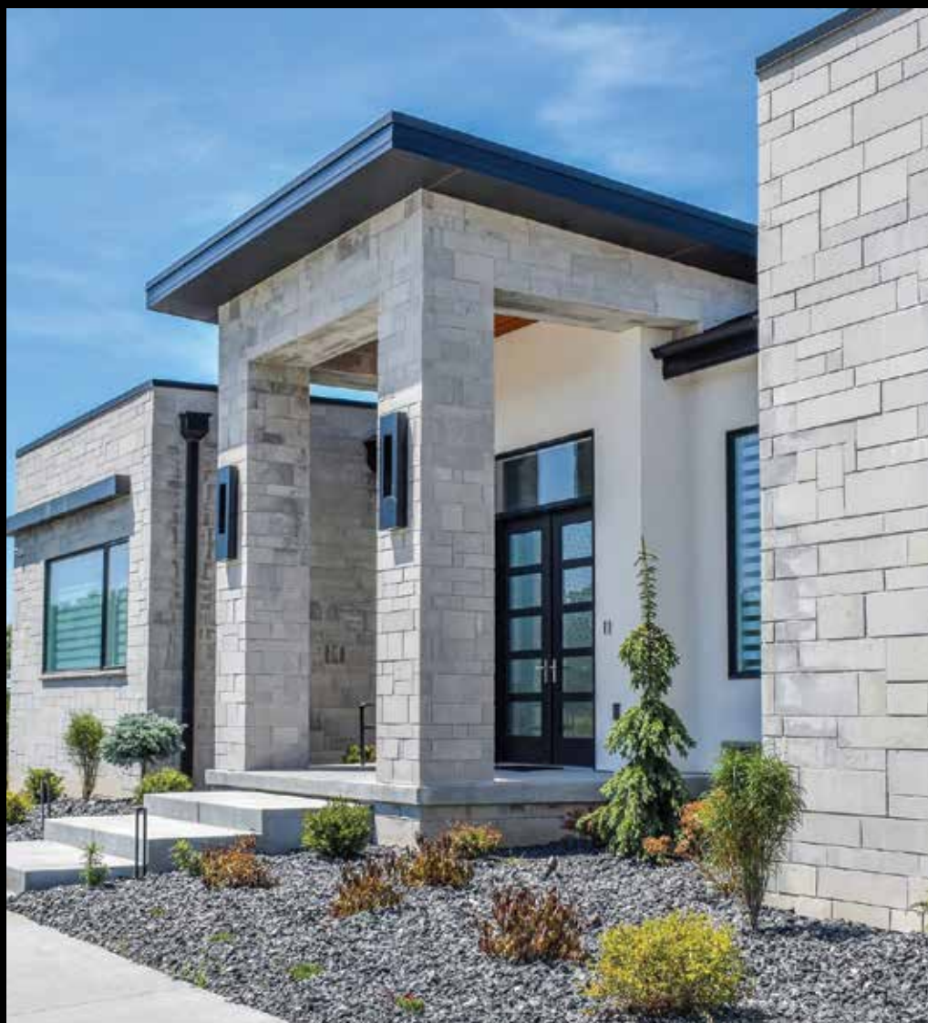
OVERCAST STACK 468

The Central Collection from Designer's Choice Stone combines a wide variety of stones into one beautiful blend. They represent a mixture of weathered edge, splitface, and bedface. No matter what your vision, Designer's Choice Stone can help bring it to reality. Most options are available in both full veneer and thin stone veneer.