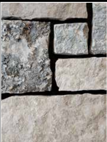
Silver Lake Grey