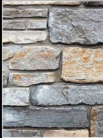
Black River Ledge